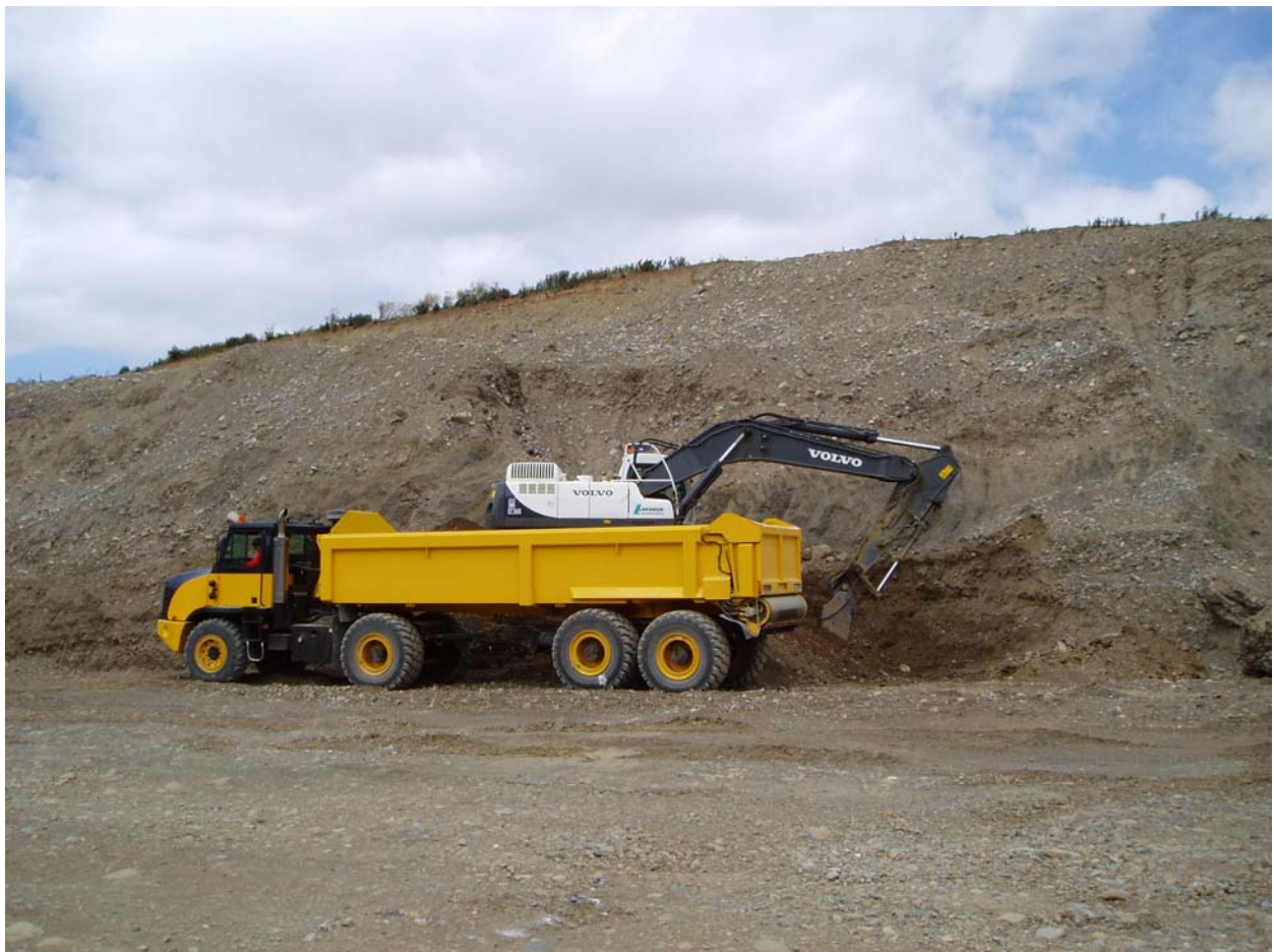
Figure 2. Crosslands Lane Quarry, North Cave. Vale of York Gravels.

The deposits around Pocklington form the Pocklington Gravel Formation, and these gravels contain an abundance of chalk and flint pebbles, with some Jurassic limestones and in one place a large amount of ironstone pebbles (ca. 10 per cent). Average clast composition is 75 per cent well-rounded chalk, 15 per cent sub-angular flint, plus 10 per cent accessory lithologies. The deposit is about 1 m thick on average. South of the Humber, significant deposits of glaciofluvial sand and gravel occur between Habrough and Laceby, where up to 15 m of well sorted sand with interbedded chalk and flint gravels overlie tills.. The high chalk, shell and coal contents of some of these deposits may restrict their use as concreting aggregate.