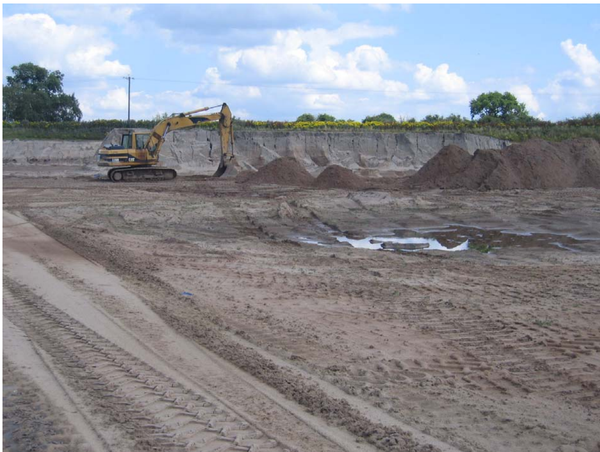
Figure 3. Recent blown sand deposits at Cove Farm Quarry

These deposits are generally composed of fine- to medium-grained sand with a mean fines (<0.063 mm) content of around 8 per cent. The sand comprises sub-rounded to well-rounded quartz grains. These deposits are believed to be largely of late Quaternary age resulting from aeolian reworking of fluvial and glaciofluvial sands, particularly those associated with the Vale of York drift deposits, including the Beighton Sands Formation. The most favourable sites for blown sand accumulation are along the lower slopes of major west-facing escarpments. Thickness is very variable, with up to 6 m being recorded around Messingham and Fonaby but generally thickness is less than 2 m, with extensive areas of sand less than 0.3 m thick. The Blown Sand deposits are mainly worked as a source of silica sand around Messingham (see above) and at Haxey for mortar sand production.